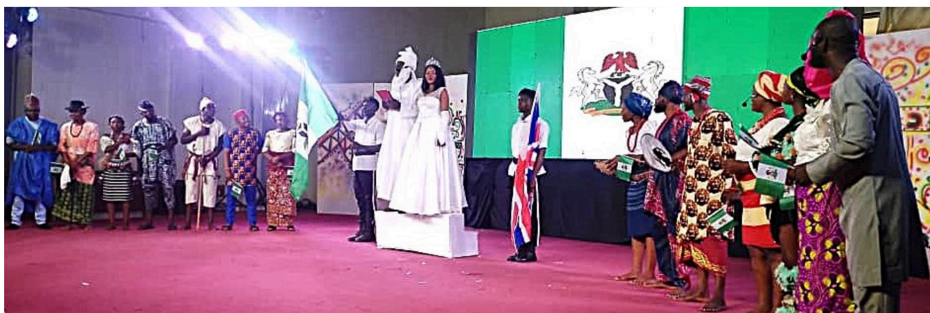
A scene from the stage performance of the play: Tafawa Balewa, the Golden Voice of Africa by the National Troupe in Abuja, 19th January 2025.