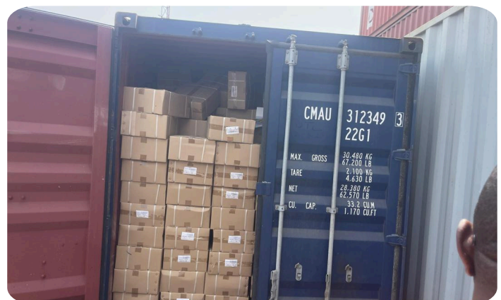
The container of suspected pirated books seized by Operatives of the Nigerian Copyright Commission (NCC) on display at Tin Can Island Port in Lagos on 21st February 2025