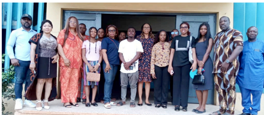
Some Executives of the IP Law Club of the University of Nigeria, Enugu Campus with staff members of the Enugu Office, during a courtesy visit to the Commission's Office, 19th February 2025.